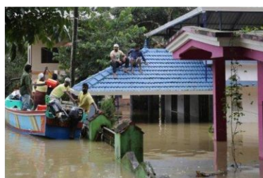
Disaster Risk Reduction & Management