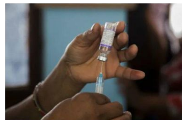
Water, Sanitation, Health & Hygiene (WaSH)